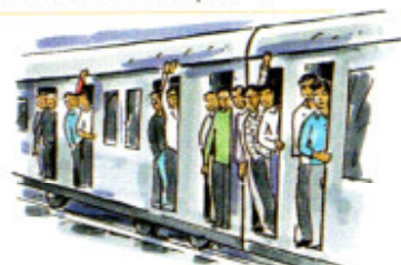
The passengers hold on to the top of the doors. French: le passager, la passag  re

I ~ed out and touched his arm. He ~ed (out) for my hand and held it tightly.