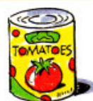
a can of tomatoes