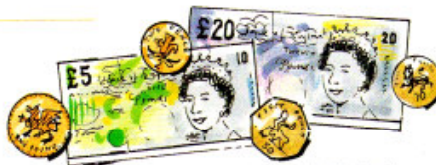
some coins and notes (BE)/ bills (AE)